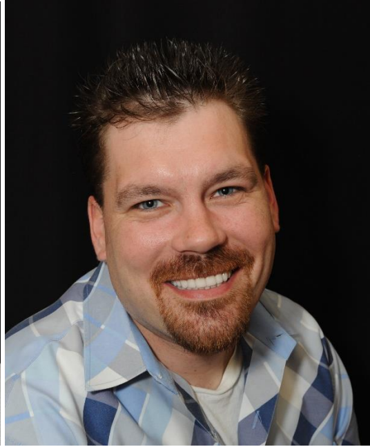
Tip- make face size the same magnification and similar pose