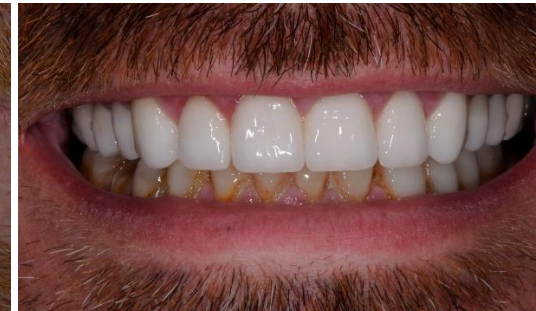
Tip- include corners of mouth , similar in magnification and smile centered