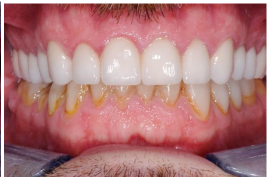
Tip- show adequate tissue-all teeth must be exposed-similar magnification